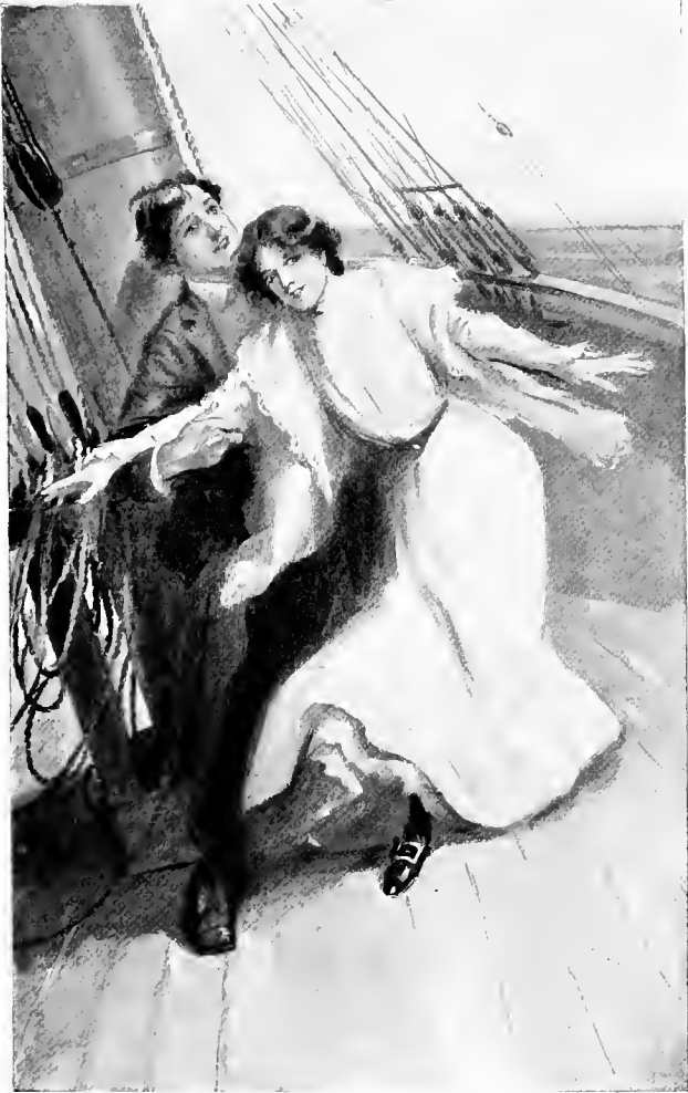
"The Matilda saw a whale, or something, and shied"